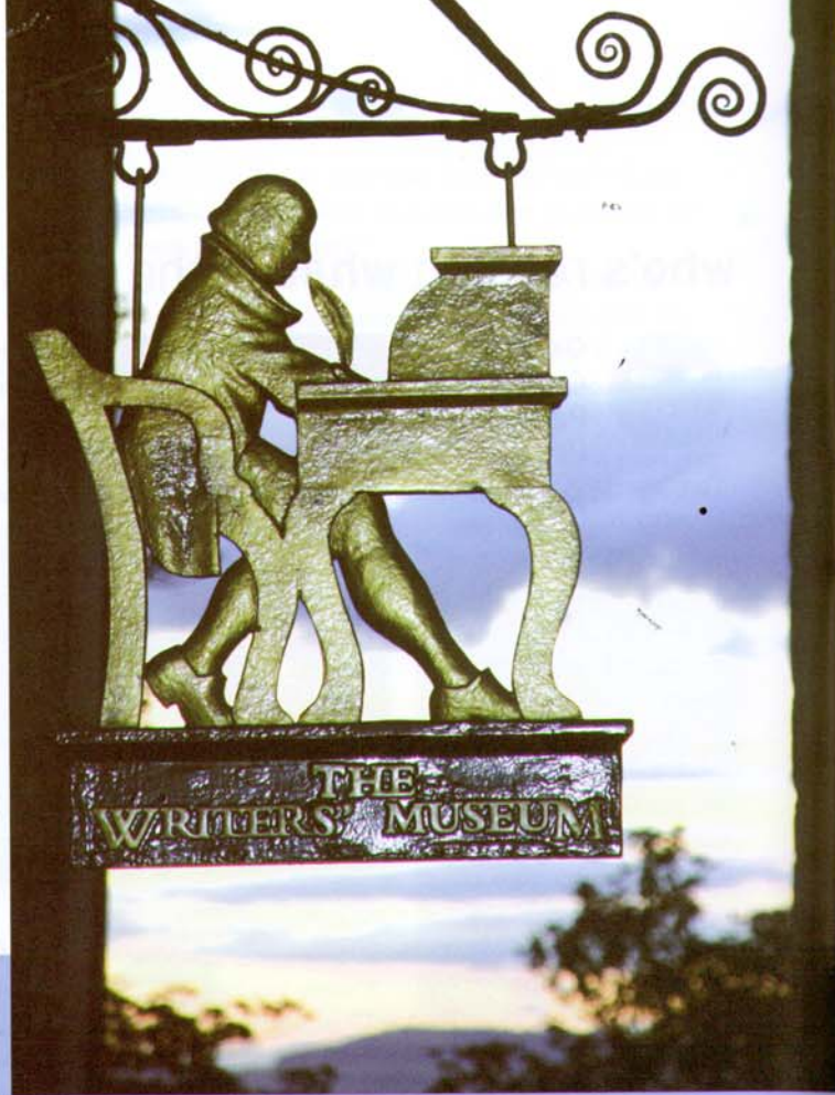
▲ The Writers' Museum in the Old Town is dedicated to the works of Robert Burns, Sir Walter Scott and Robert Louis Stevenson.